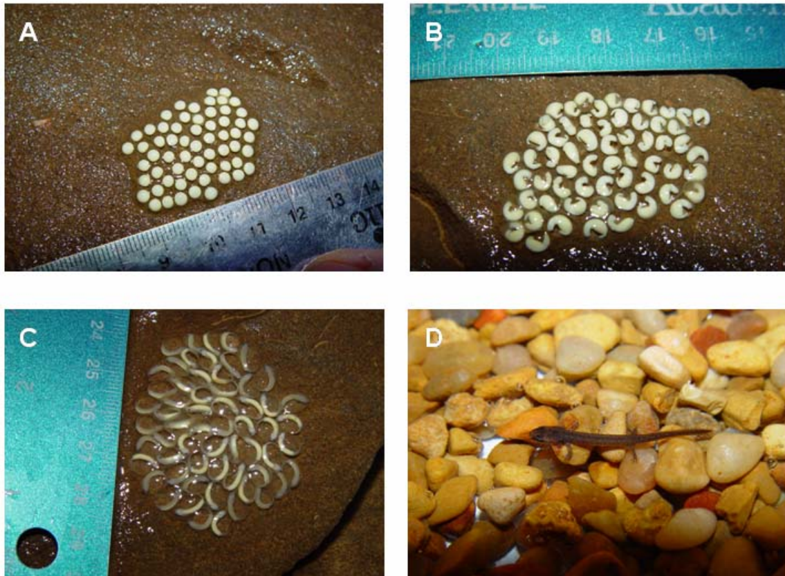
FIGURE 1. Chronology of development of Southern Two-lined Salamander ( Eurycea cirrigera ) clutch no. 1 from a privately-owned cave on Short Mountain, Cannon Co., Tennessee. Eggs at (A) Harrison stage 11 on 26 January 2005, (B) Harrison stage 31 on 09 February 2005, (C) Harrison stage 42 on 26 February 2005, and (D) a hatchling without yolk collected on 26 February 2005.

southeastern United States northward into Illinois, Indiana, and southern Ohio (Pauley and Watson 2005). The species is common throughout its range and typically inhabits the margins of small, rocky streams and seeps in forested areas, but is common also in and around springs and spring runs (Mount 1975; Petranka 1998). Oviposition typically occurs in flowing water where eggs are attached singly in a monolayer to the undersurfaces of submerged rocks or logs that are embedded in the stream bottom (Baumann and Huels 1982; Martof et al. 1980; Mount 1975; Petranka 1998). Although Southern Two-lined Salamanders occasionally are reported from subterranean environments (West Virginia, Carey 1973; Pauley 1993; Osbourn 2005; Mississippi, Carey 1982; Himes et al. 2004), neither the significance of their subterranean occurrence, nor their use of cave systems for reproduction has been discussed. Here, we describe several reproductive parameters (timing of migration by adults, timing of oviposition, incubation period, clutch size, and size at hatching) of a population of the Southern Two-lined Salamander in middle Tennessee that uses a subterranean stream for reproduction.